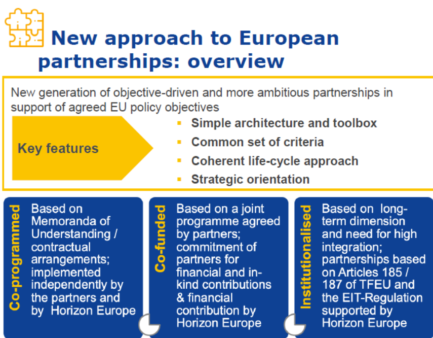
Figure 1: The new approach to European Partnerships